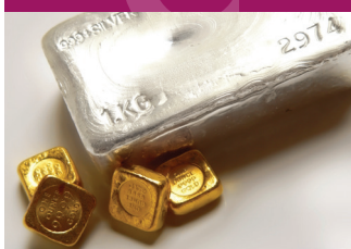
Precious Metal Electroplating

A variety of complex anode structures are available from solid sheet or mesh material with electrical connections to tubes, rod and wire. Base materials available include titanium, niobium and tantalum to meet unique corrosion resistance requirements.